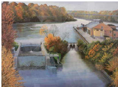
Appleton Lock No. 1 by Thomas J. Schultz

These works include oils, etchings, pastels, watercolors, and molded cloth. Their form includes realistic animals and landscapes, as well as impressionistic works and surrealism.