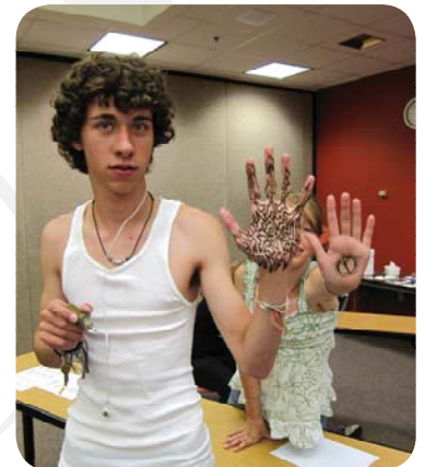
Teens created Henna tattoos