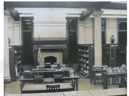
Appleton Library, ca. 1950

A complete photo listing of the library’s art collection can be viewed at this link: http://www.apl.org/art.html .