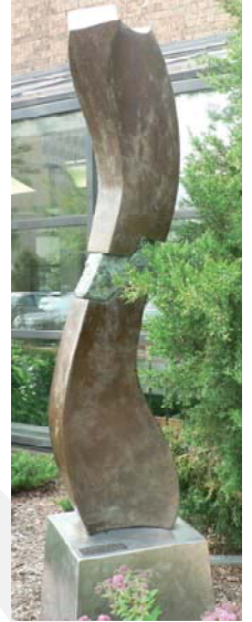
Dancing Curves by Frank Morbillo