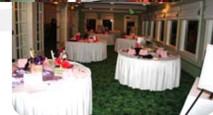
Shots from this year's I Love My Library Dinner, held this year at North Shore Golf Club